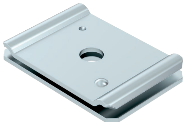
Two-part centre suspension of mesh cable trays.