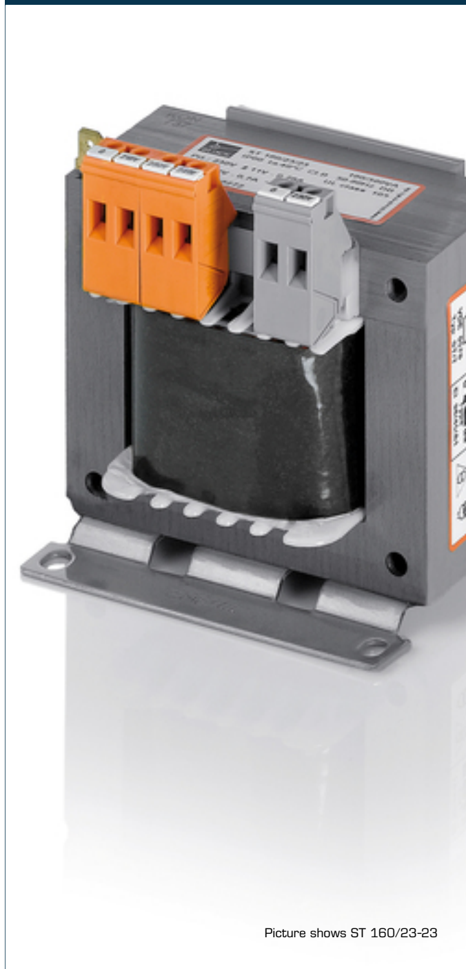
Picture shows ST 160/23-23