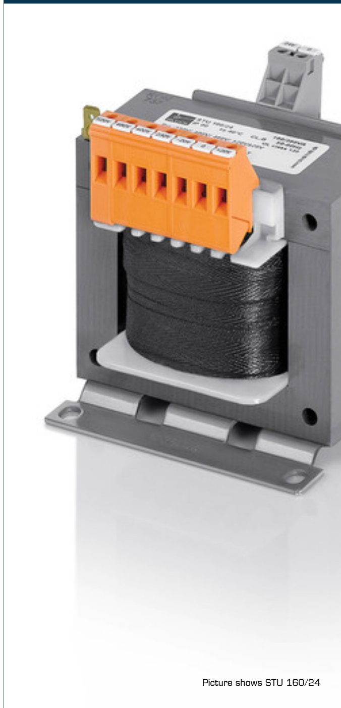
Picture shows STU 160/24