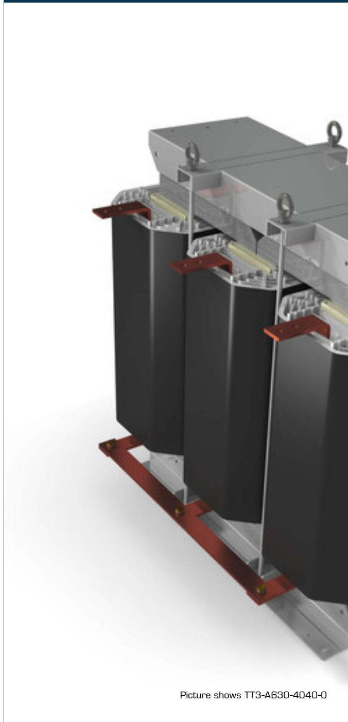
Picture shows TT3-A630-4040-0