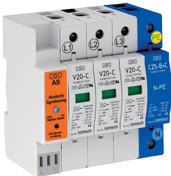
Surge arrester, type 2